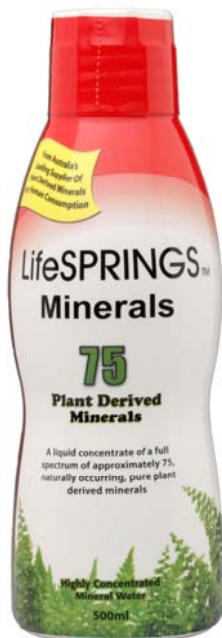
The Brand New LifeSPRINGS 75 Plant Derived Minerals

Everything looks new, but the product still remains the same. With the constant trouble of defining the term Colloidal Minerals we have begun using the simplified meaning which is Plant Derived Minerals.